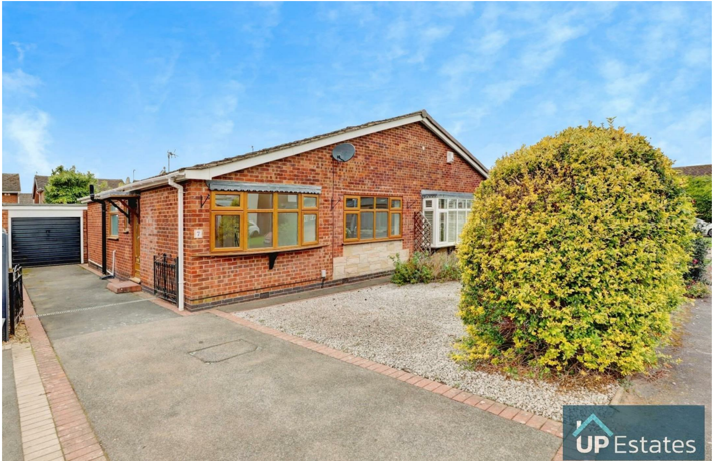
Barne Close, Whitestone, Nuneaton